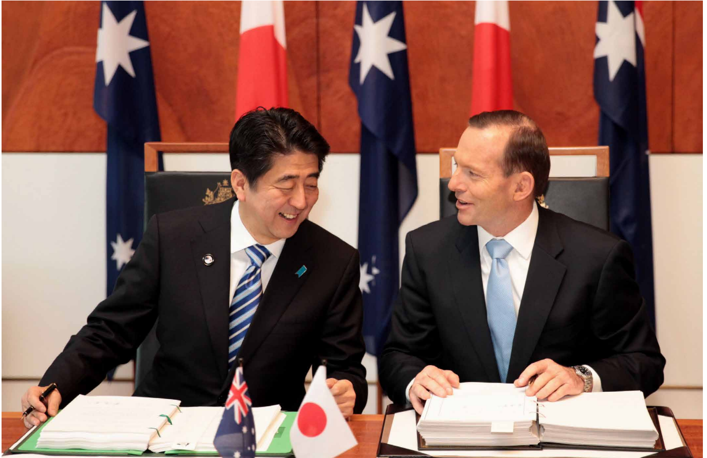
Japanese Prime Minister Shinzō Abe (L) and Prime Minister Tony Abbott smile after signing the Japan-Australia Economic Partnership Agreement and Agreement on the Transfer of Defence Equipment and Technology in the Mural Hall at Parliament House in Canberra, 8 July 2014.