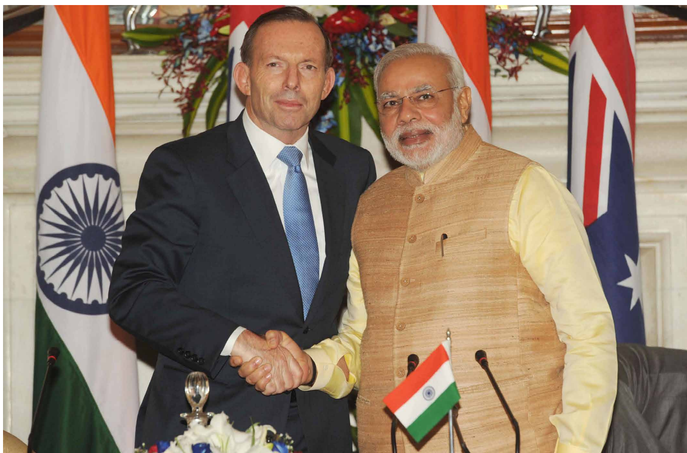
The Prime Minister of Australia Mr Tony Abbott with India's Prime Minister Narendra Modi during Mr Abbott's state visit to India, 5 September, 2014.

But it was the Framework for Security Cooperation that was the visit's most substantive development. The accord instituted annual executive and ministerial meetings, regular maritime exercises, joint military training, defence technology sharing, and cooperation on such matters as counterterrorism, border protection and disaster management. It not only signified 'deepening